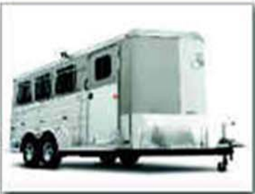
Come see the new line up of Logan Coach Aluminum Skin Horse Trailers!

1-877-753-2221 or online at www.kiperts.com